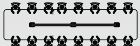
ATDSCAS340M & AS340E + AS340E Speakerphone with Expansion

AVAILABLE THROUGH PAN INDIA DISTRIBUTOR & DEALER NETWORK