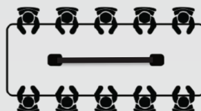
ATDSCAS340M & AS340E Speakerphone with Expansion